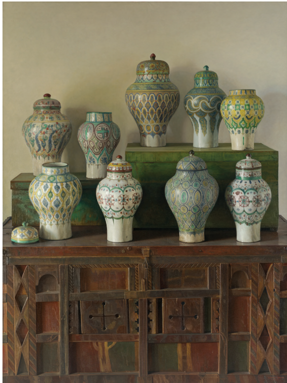
Khabyas, 2002 oil on canvas 78 1/2 x 58 7/8 inches 199.4 x 149.5 cm