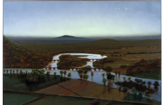
The Oxbow: After Church, After Cole, Flooded (Flooded River for the Matriarchs E. & A. Mongan), Green Light (2000)

The book features 500 paintings from The Metropolitan Museum of Art's collection of over two million works of art. These works, created over a span of more than 5,000 years, are arranged in chronological order and each is accompanied by an essay by curator and scholar Kathryn Calley Galitz. The honor of being selected is all the more significant for the fact that just a small percentage of the chosen works are by living artists.